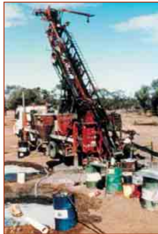
Untidy sites lead to accidents