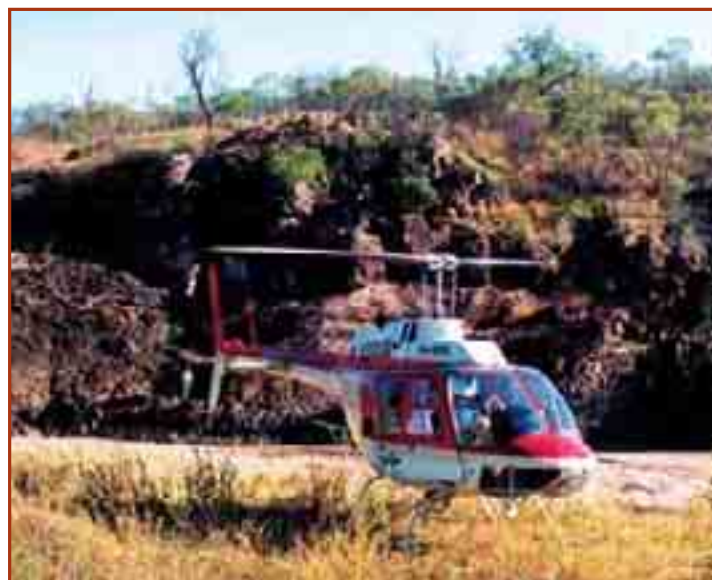
Helicopters are a valuable aid to exploration